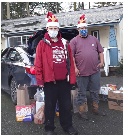
We held a food drive