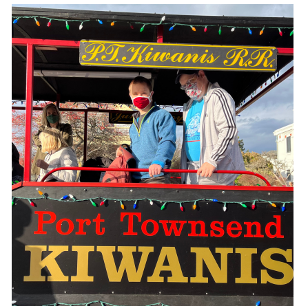
We rode the Kiwanis Christmas Train