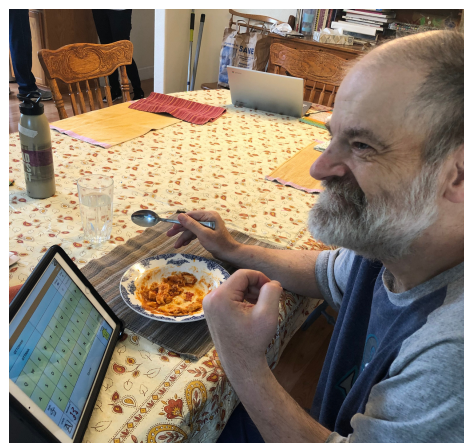
We learned new ways to communicate