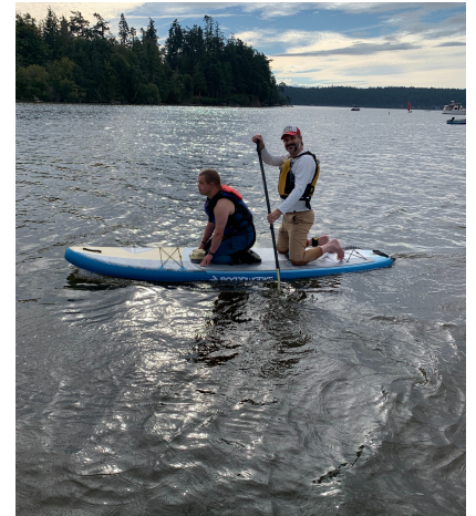
We tried new things