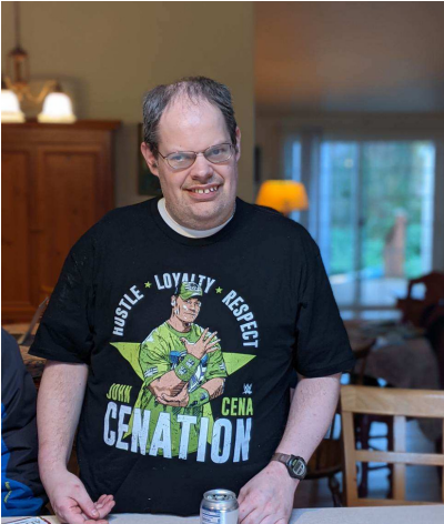
We welcomed a new resident