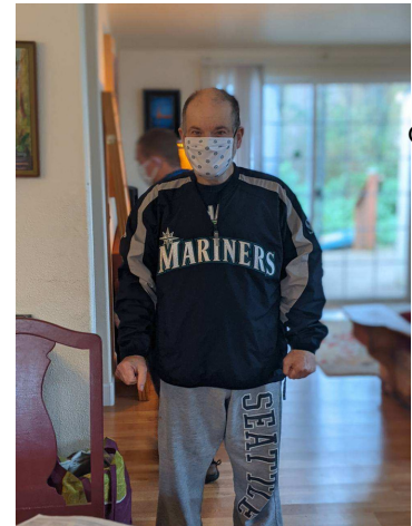
We cheered for our favorite teams

We Provided Care to 7 Different Residents