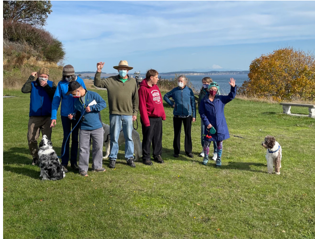
We walked almost every single Tuesday with friends